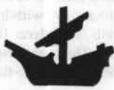
RED STEEL® Swashbuckling Fantasy Setting